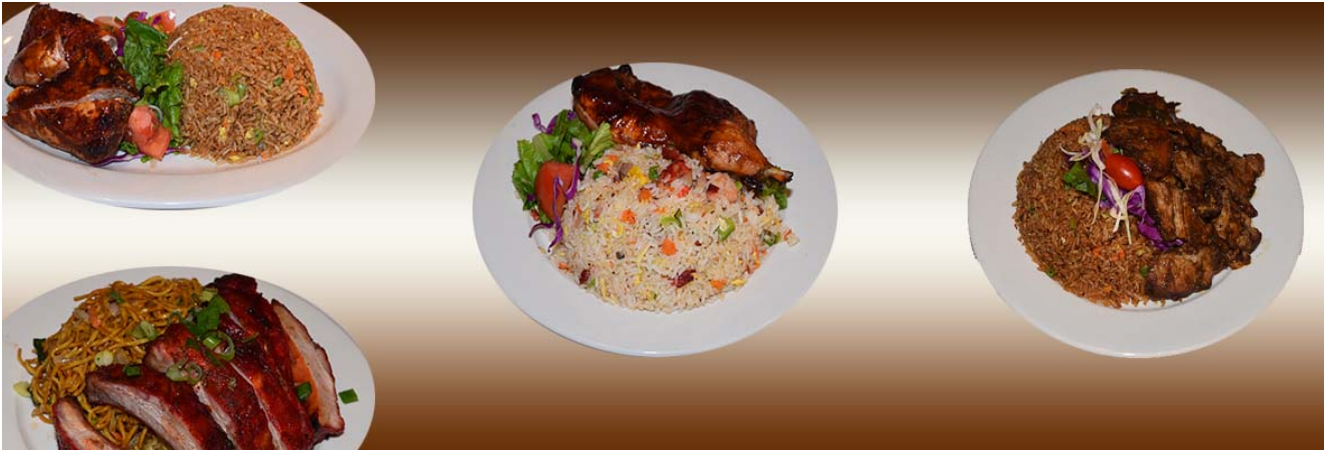
Finest in Guyanese-style Chinese Cuisine